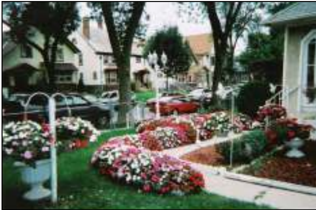
2nd Place (Place Category) - Nellys Rivera not only took this photo, but also created the beautiful yard shown in the picture.