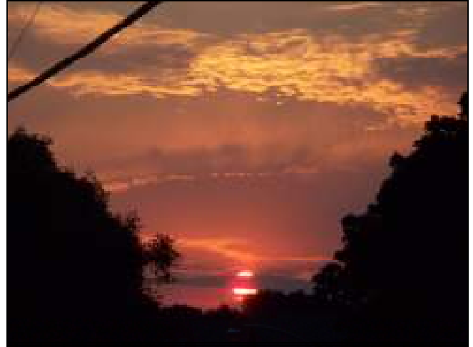
Tied for 1st Place (Places Category) - Judy Allis snapped this beautiful sunset from behind Grace Chapel Church on 33rd & Lapham.