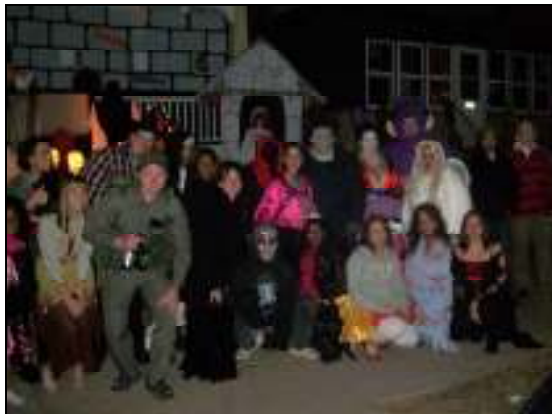
2nd Place (People Category) - see page 2 of the newsletter.